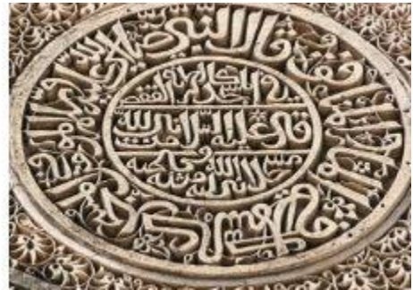
Sacred art is a way to enhance remembrance

When we remember our Lord, He remembers us. In the Quran God says, "Remember Me; I will remember you." (2:152). When He remember us He is giving us His healing, mercy and knowledge, so it is ideal to practice remembrance all of the time, 24/7.