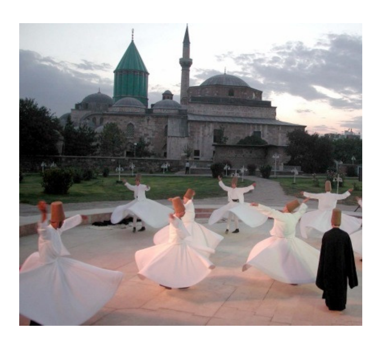
Sema outside Rumi's tomb